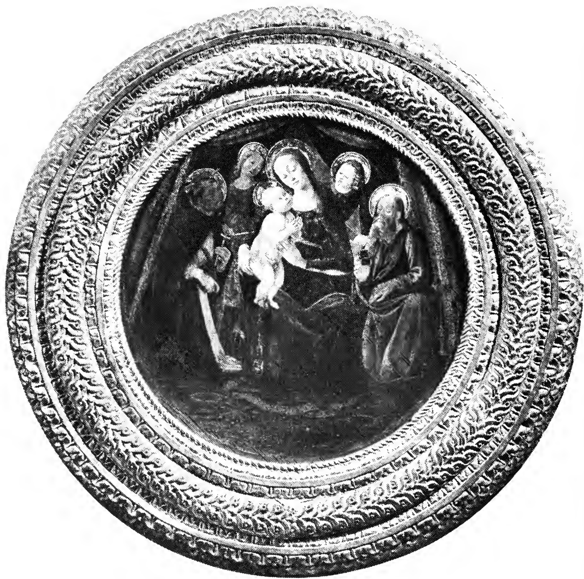
Figure 2. Jacopo di Sellaio, Madonna of Humility with St. Peter Martyr, Tobit, and Two Angels, c. 1480, Museo del Bigallo, Florence.