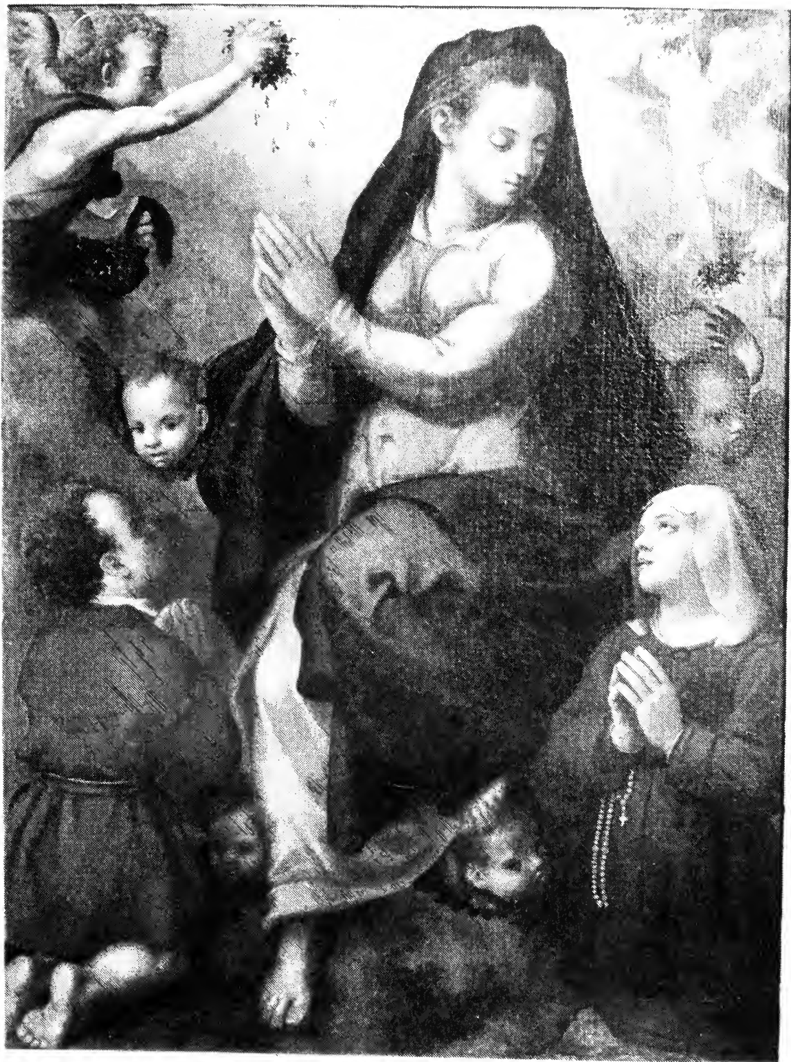
Figure 3. Carlo Portelli, Madonna in Heaven with Angels Adored by Two Children , c. 1570, Museo del Bigallo, Florence.